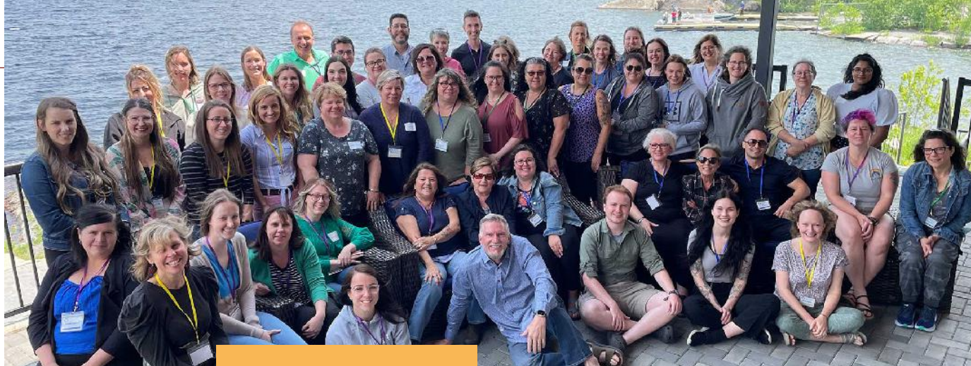
Team retreat, City of Lakes FHT