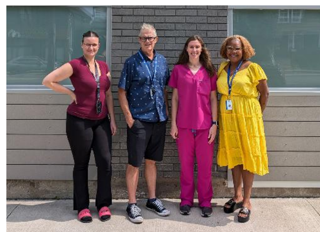
Health Care at Eva Rothwell Centre, Hamilton FHT, Greater Hamilton Health Network