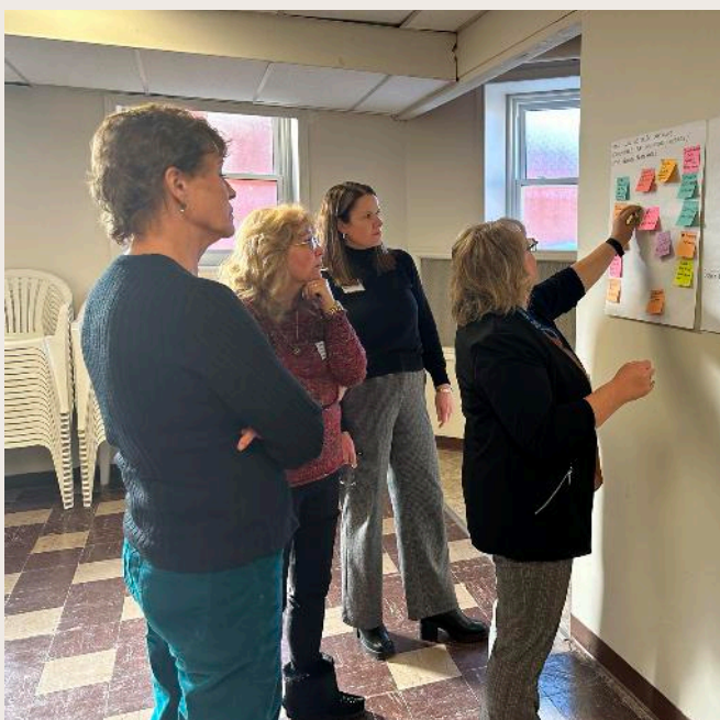
Palliative care navigation, Grey Bruce OHT

We are excited for what's to come and working with our members and partners we will relentlessly pursue our vision of achieving equitable access to excellent team-based primary care for every person in Ontario.