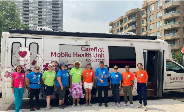
North York FHT Community Health and Information Fairs

Congratulations to all our winners and nominees!