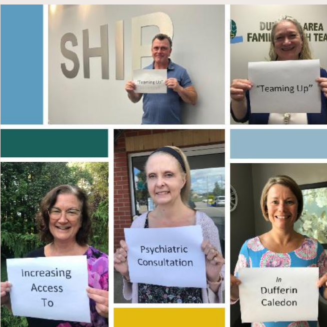
Dufferin Area FHT and SHIP (Services and Housing in the Province)