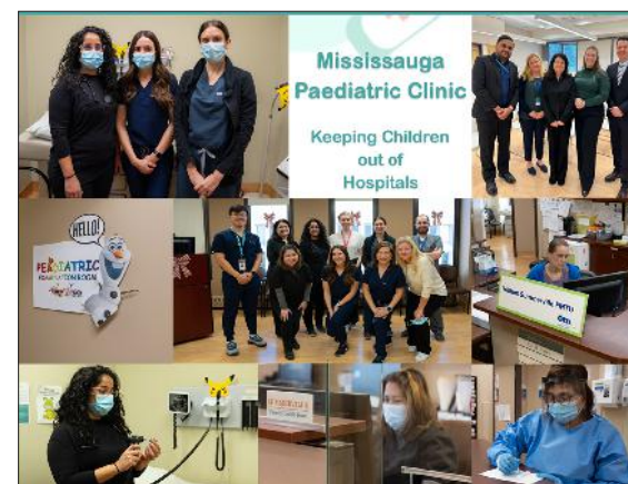
Mississauga Paediatric Care Clinic, Mississauga OHT