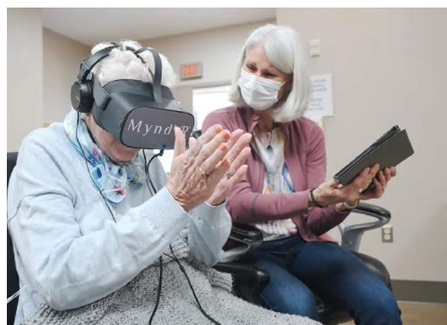
Enhancing senior wellbeing with virtual reality adventures, Parry Sound FHT