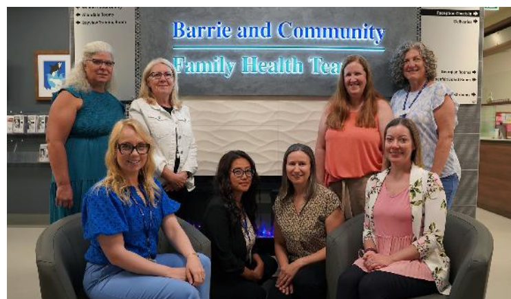
Barrie and Community FHT Bone Health program