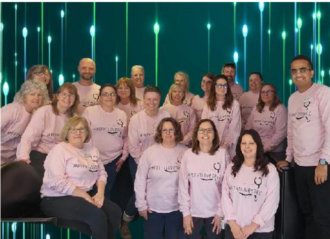
Prince Edward FHT Community Clinic