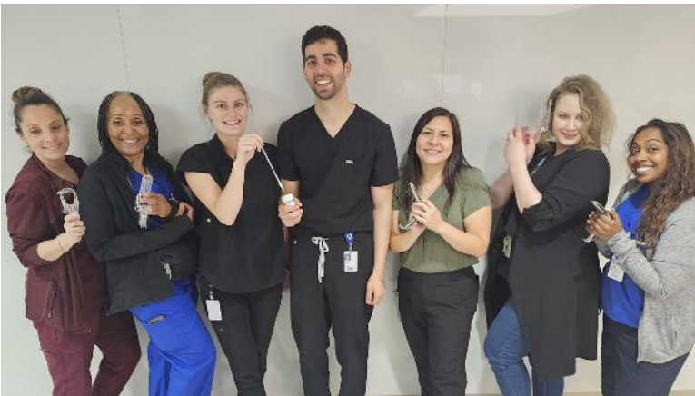
Toronto Western FHT