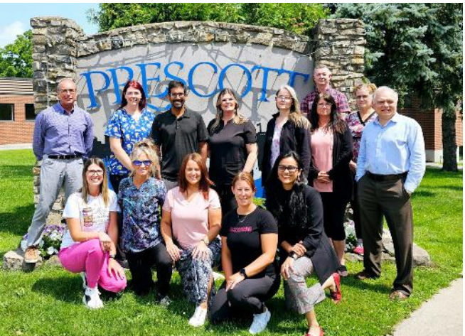
Prescott FHT Workplace Wellness Committee