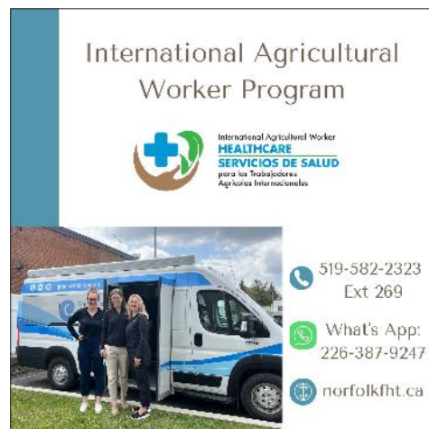
International Agricultural Worker Program, Norfolk FHT