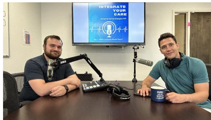
Integrate Your Care Podcast, hosted by Central Brampton FHT