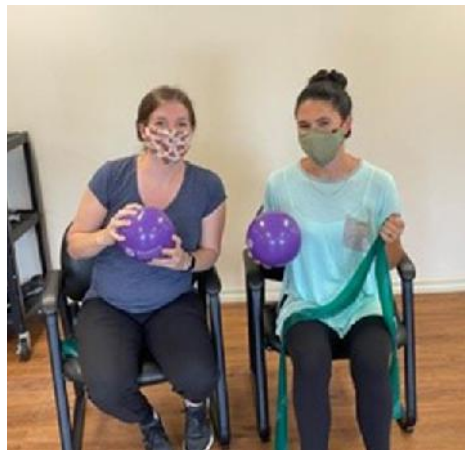
Above: Couchiching FHT works with partners to ensure one door for all frail seniors to access comprehensive geriatric assessment and treatment.