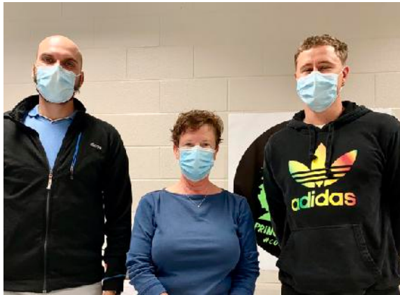
Top: A resident is swabbed at Atikokan FHT, who led the COVID-19 assessment centre for the community and surrounding area.