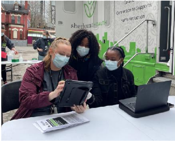
Above: St Michael's Hospital Academic FHT, Sherbourne Health Centre FHT, and Inner City FHT recognized unique vulnerabilities in downtown Toronto. They used mobile methods to help ensure access to vaccines for people in encampments, shelters, and other congregate settings.

“COVID-19 provided pointed lessons in applying an equity lens to health care. Brampton was disproportionately impacted by demands for the essential industries in our region. Understanding the diversity of our community meant providing care in non-traditional places. Through building new relationships, we increased access for health assessments, testing, and vaccinations. Our COVID Response Centre is open to everyone, including new immigrants and residents without a regular primary care provider. With the spread of the virus so prominent, we had to ensure all individuals got the care they needed to ensure a healthier and safer community.”