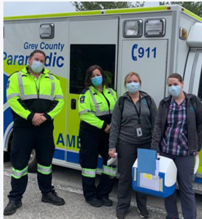
Above: Owen Sound FHT and Grey County Paramedic Services worked together to vaccinate homebound patients.

"Being able to witness and be a part of health care providers and community members coming together to provide vaccination in long-term care was incredibly inspiring. The energy of hope and gratefulness was so palpable. It is something I will never forget."