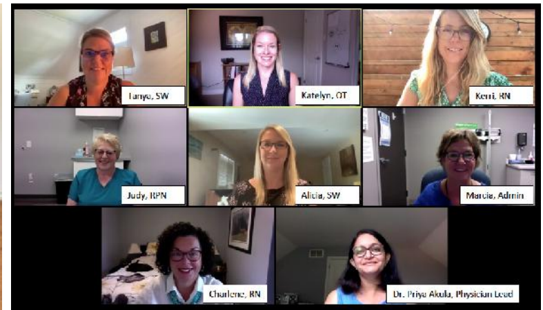
Above: The Cognitive Assessment Team (CAT) at Dufferin Area FHT deconstructed the traditional memory clinic into something accessible and timely during the pandemic. A hybrid model of care, including in person and virtual, was developed to assess, treat, and manage cognitive impairment. The model addresses previous challenges such as wait times, which have dropped from 120 days to 23 days.