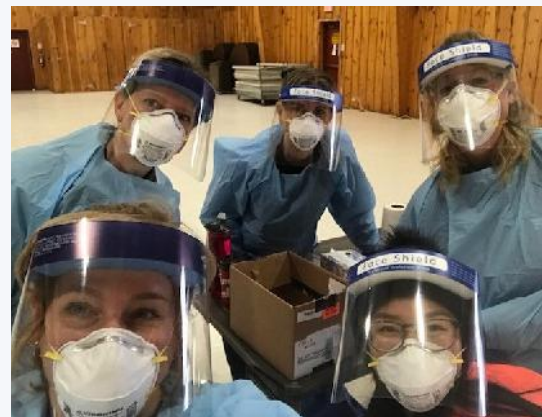
Top: Markham FHT visited long-term care and retirement homes to vaccinate residents.